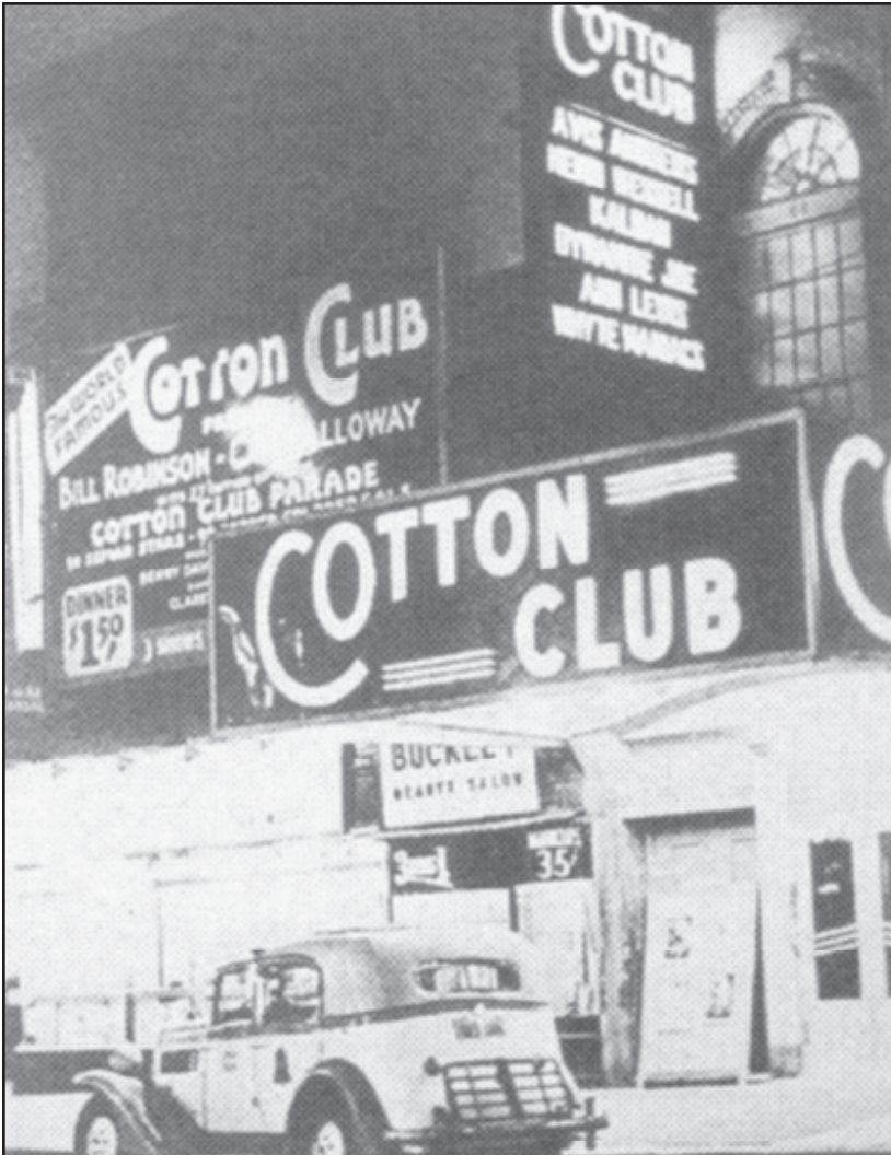
THE HARLEM RENAISSANCE, 1925-1934 brought African-American music, dance, artistic and literary achievement into the mainstream of American culture.