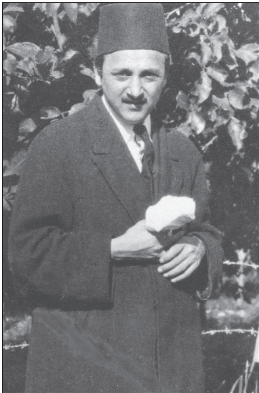
SHOGHI EFFENDI RABBANI