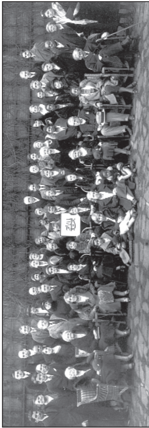
Bahá'í World Center